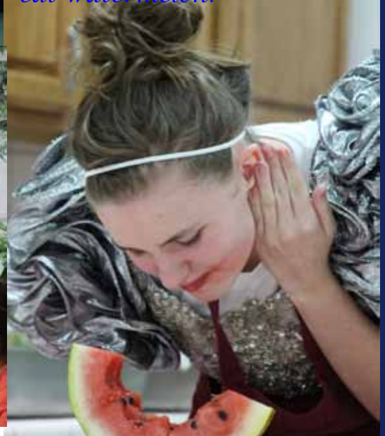
Have you ever seen Queenie eat watermelon?