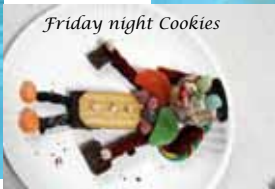
Friday night Cookies