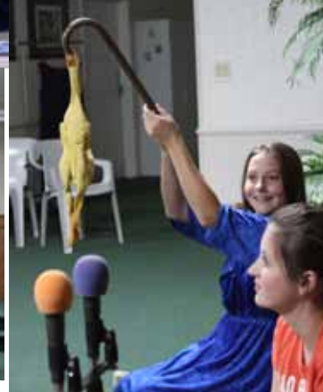
Look! I've caught a Fish! No a Chicken?