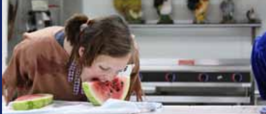
Watch carefully; Girl eating watermelon!