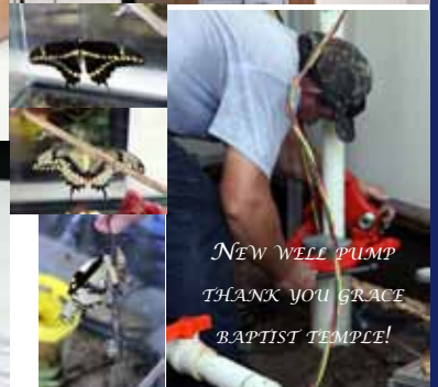
NEW WELL PUMP THANK YOU GRACE BAPTIST TEMPLE!