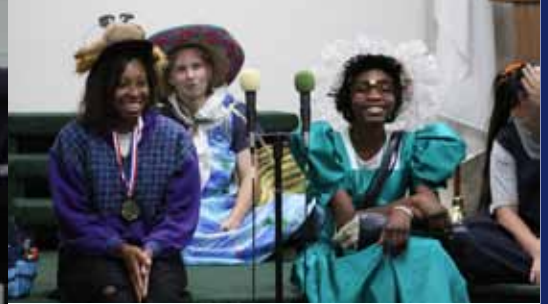
Something to do; nowhere to happen